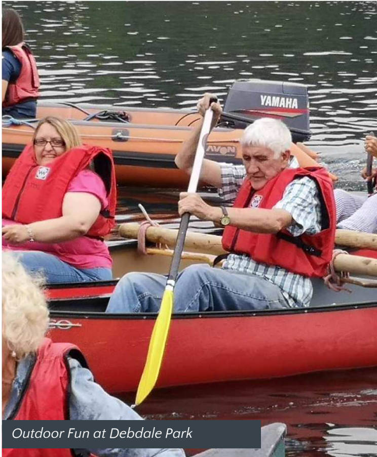
Outdoor Fun at Debdale Park