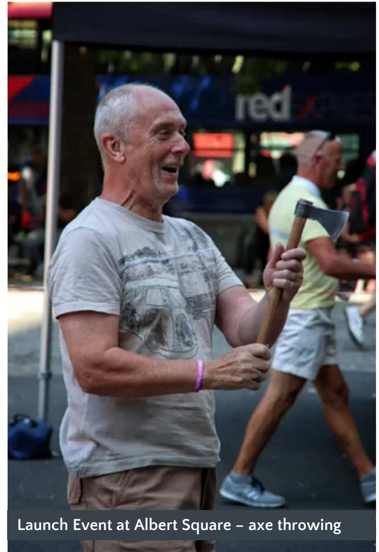
Launch Event at Albert Square – axe throwing