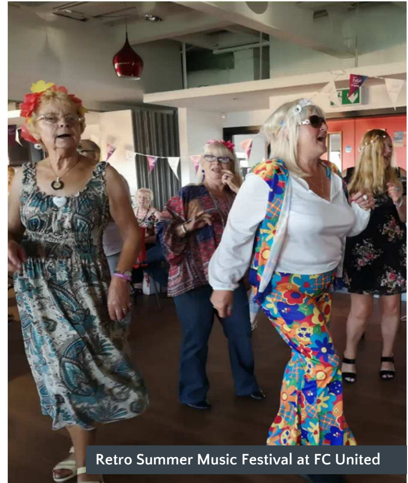
Retro Summer Music Festival at FC United